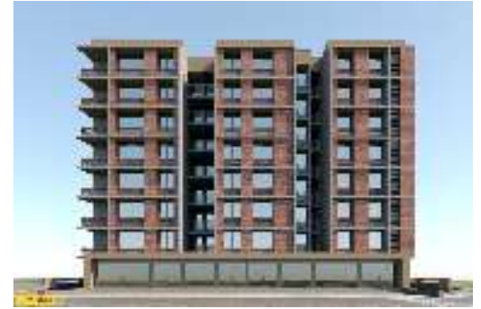
PANCHSHIL MINA PARK APARTMENTS

LOCATION : Opp. Telephone Exchange, Gulbai Tekra, Ambawadi, Ahmedabad.