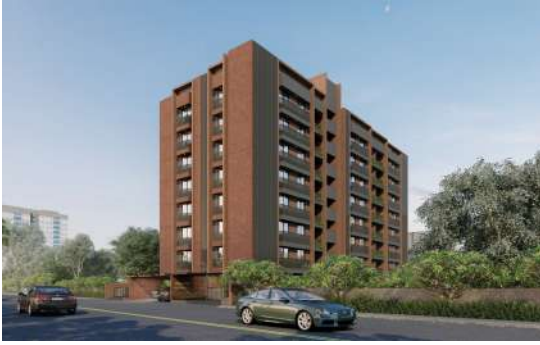
PANCHSHIL NIRMALKUNJ APARTMENTS