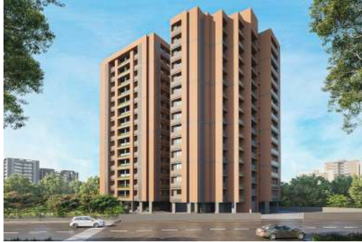
PANCHSHIL POOJA FLATS

LOCATION : Behind Navgujarat College, Riverfront Road, Usmanpura, Ahmedabad.